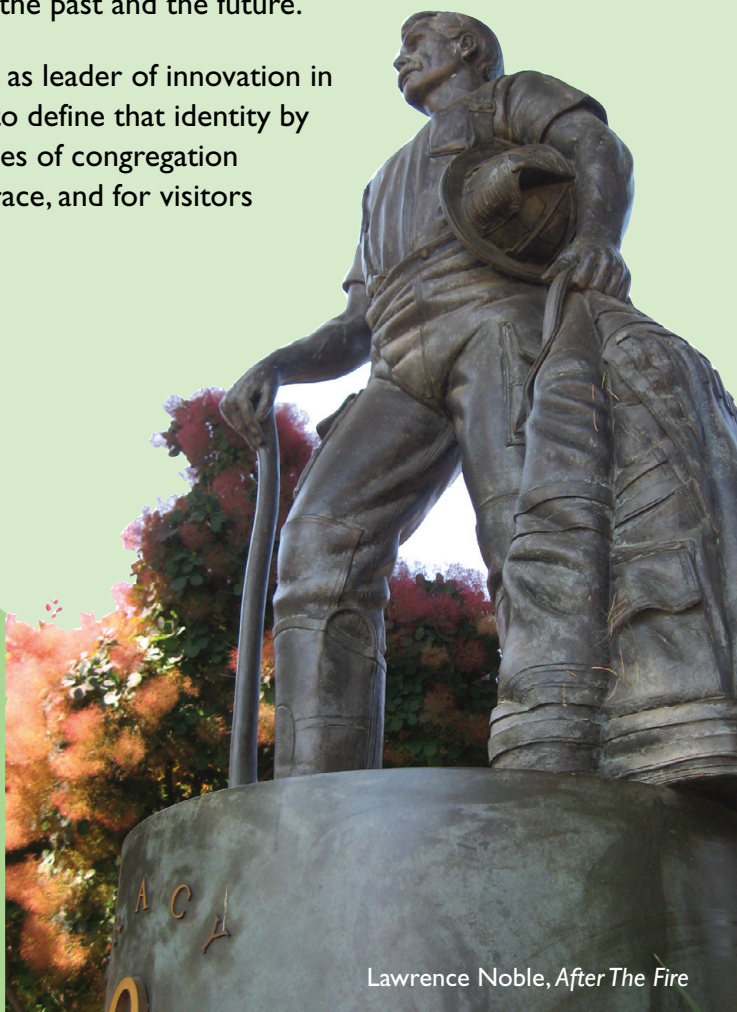
Lawrence Noble, After The Fire