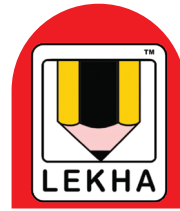
Lekha Ink. Staff Literary Arts