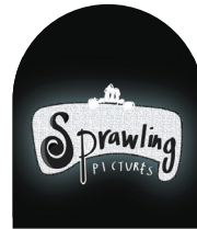
Sprawling Pictures Visual Arts