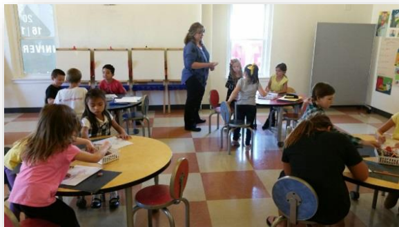
Elementary Drawing in the Children’s Art Studio

The City of Tracy will follow all CDC Guidelines, State & County Guidelines, and Education Industry Guidelines.