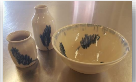
Pottery from the Ceramics Studio