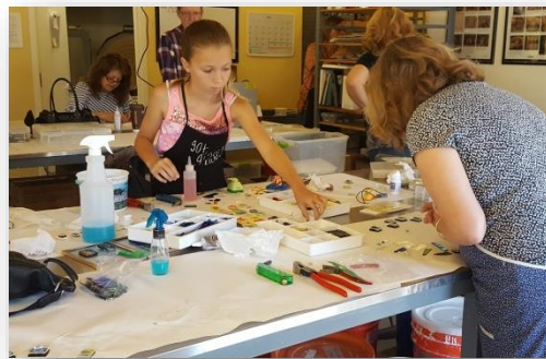
Fused Glass Lab in the Ceramics Studio