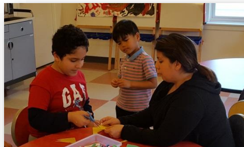
Art for Children with Special Needs