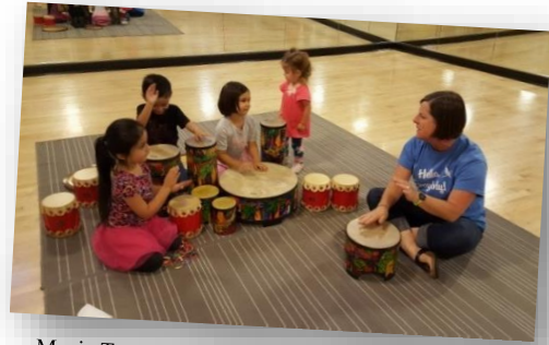
Music Together® in the Dance Studio

The Arts Education Program closes for several weeks between semesters for facility maintenance. The Grand Theatre Center for the Arts is also closed for Thanksgiving break and several weeks in December and January for the holidays. No classes will be held during these times.