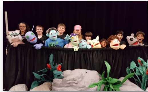
Puppet Making in the Studio Theatre

It is imperative that Contract Instructors always be helpful and courteous. The City of Tracy does not condone inappropriate or offensive behavior by or towards Contract Instructors, participants, and City Staff. If a Contract Instructor, participant, or guest engages in an inappropriate or unsafe manner, he or she will be asked to leave the premises. Possession or use of drugs or alcohol while conducting or participating in a class is strictly prohibited.